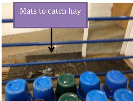
Mats to catch hay

-In the winter, people on morning chores must bring the frozen water buckets into the warm room so that they can melt. The person doing noon check must empty the buckets and get rid of all the remaining ice and then bring the buckets back into the individual stalls. Buckets will be filled by people on evening chores. Stack the buckets close to the inside door, above the rubber mats to catch the hay. Buckets used for soaking grain should be stacked separately (e.g. to the left as in the picture below)