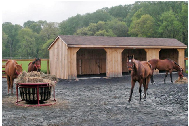
Concentrated Animal Area