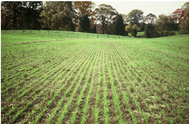
Emerging seedlings no till planting