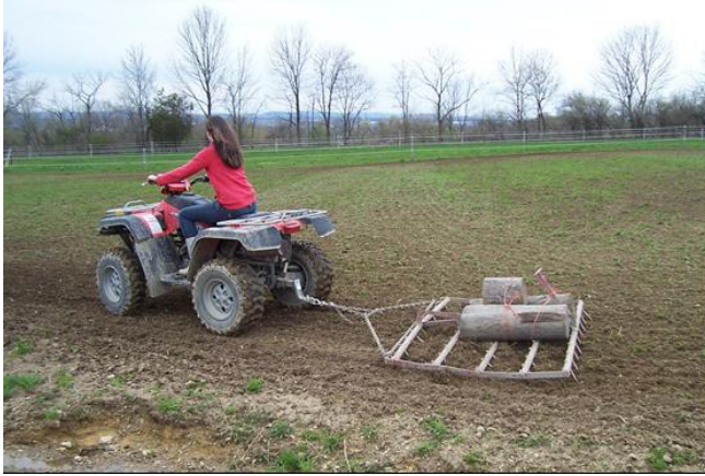
4-wheeler and spike harrow