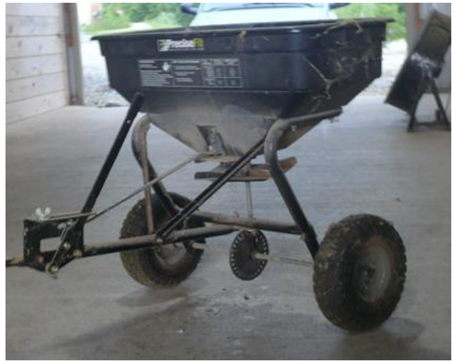
A basic pull-behind spinner spreader works well for applying fertilizer and lime to small acreage pastures.

Acidic soils prevent adequate nutrient uptake, but also restrict and stunt root growth.